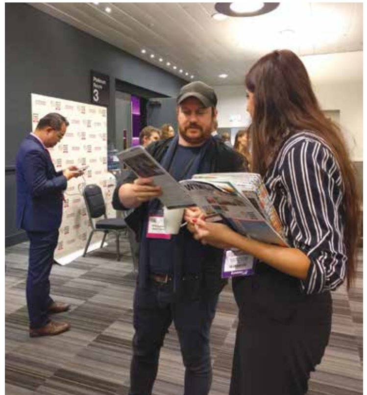
Distribution of RT publication