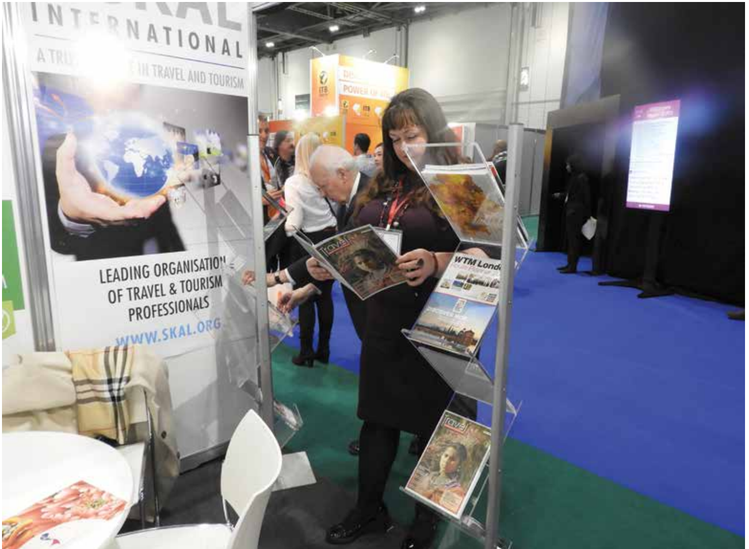
RT publication display at SKAL pavilion