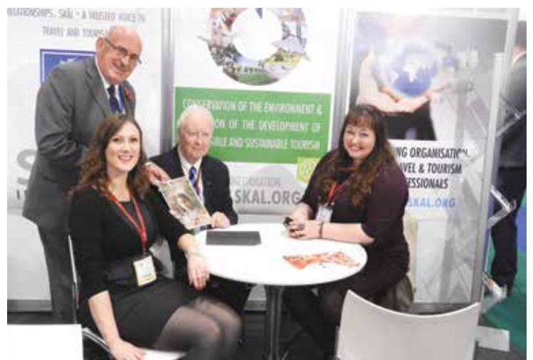
SKAL booth with President and Board of Directors