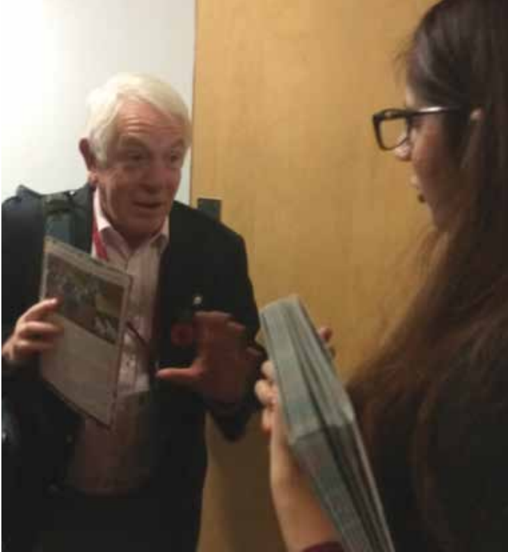
Discussion with travel industry professional