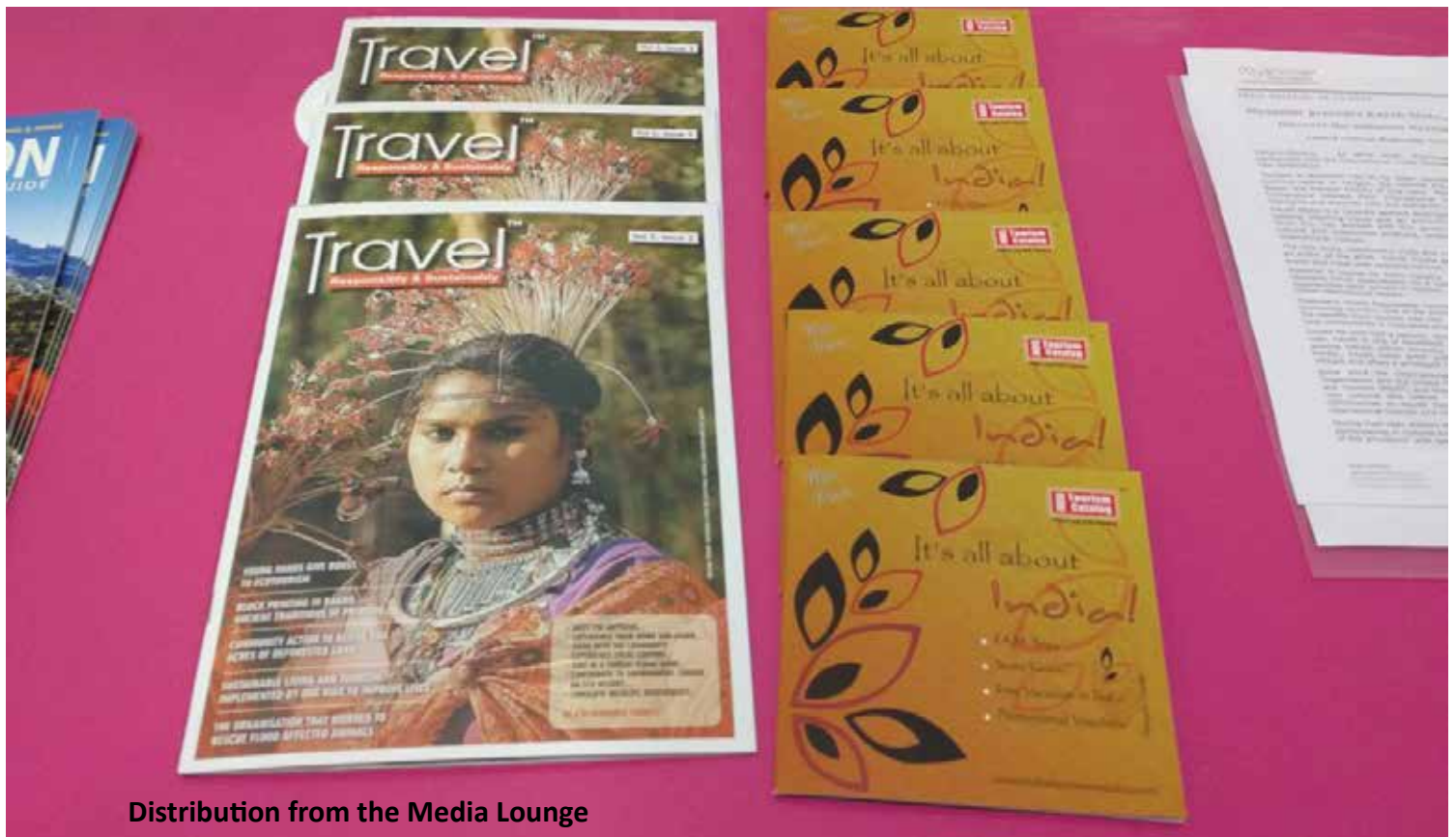
Distribution from the Media Lounge

Direct meetings were held with 2-3 tour operators and there was considerable interest in sustainable tours to India.