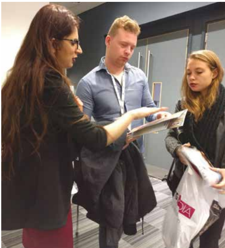
Explaining about RT publication