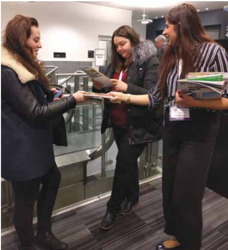
Discussion about RT publication