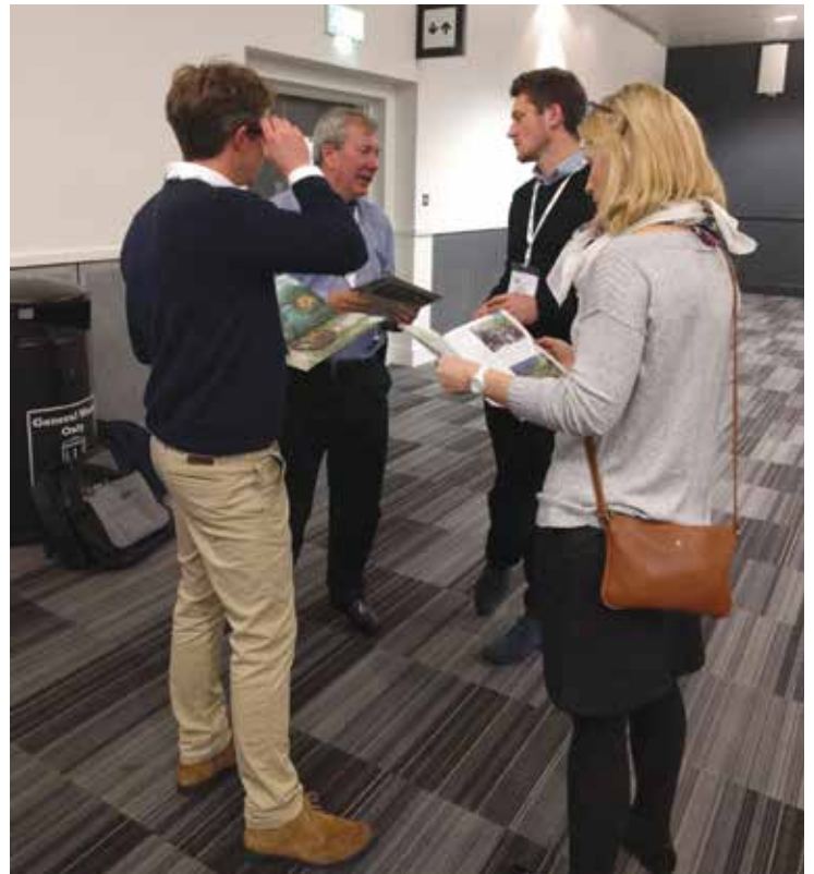
People reading and discussing the articles