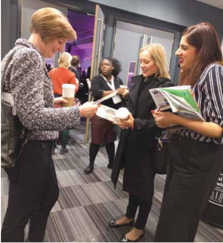
Distribution in the Hall