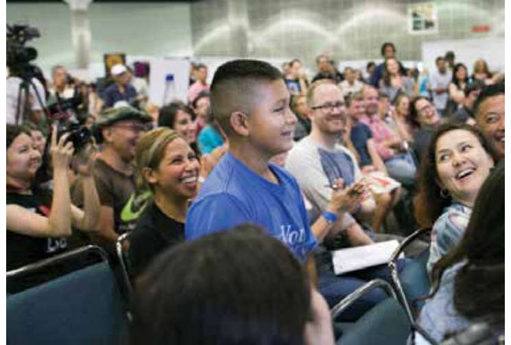
View of Audience