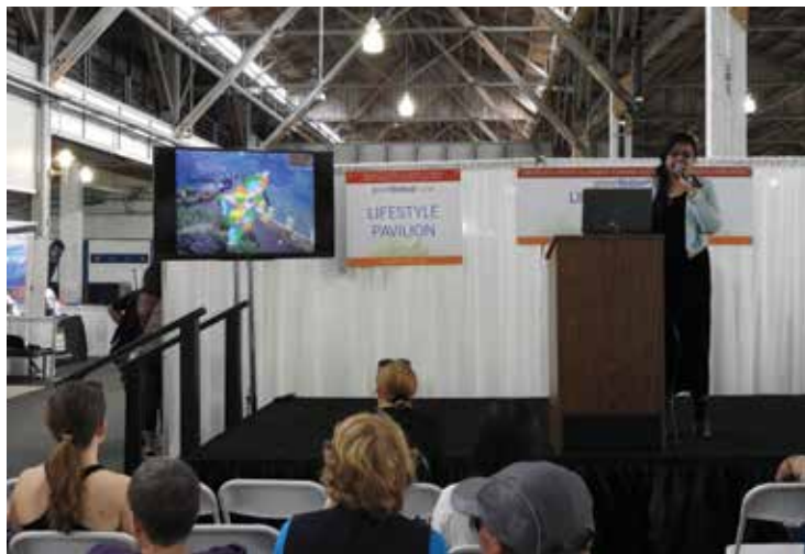
Presentation of Tamil Nadu