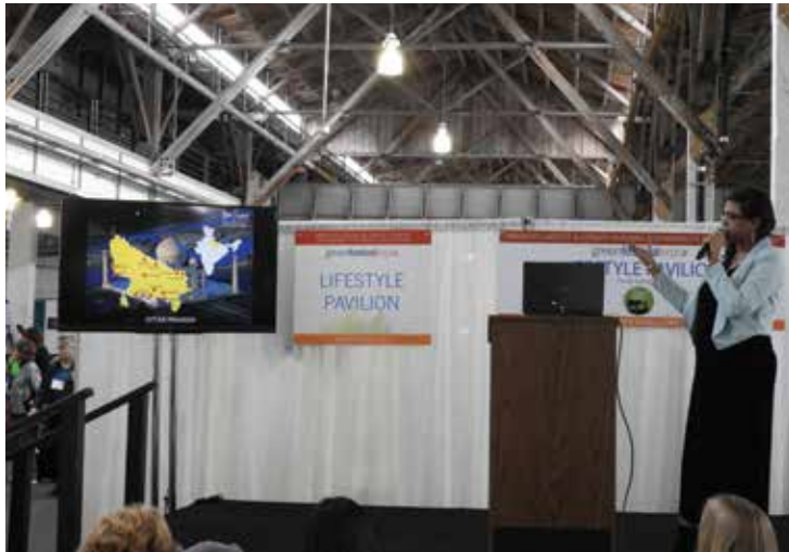
Presentation of Uttar Pradesh