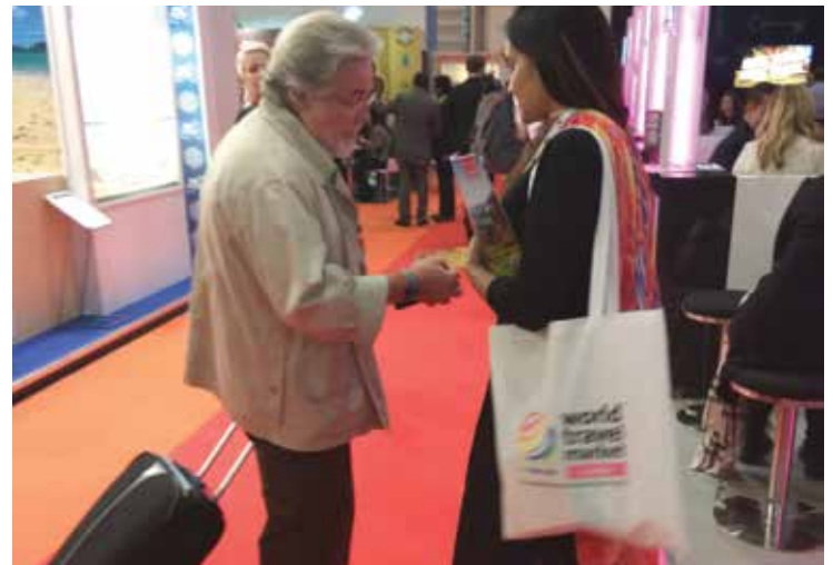
Hostess distributed to the buyers