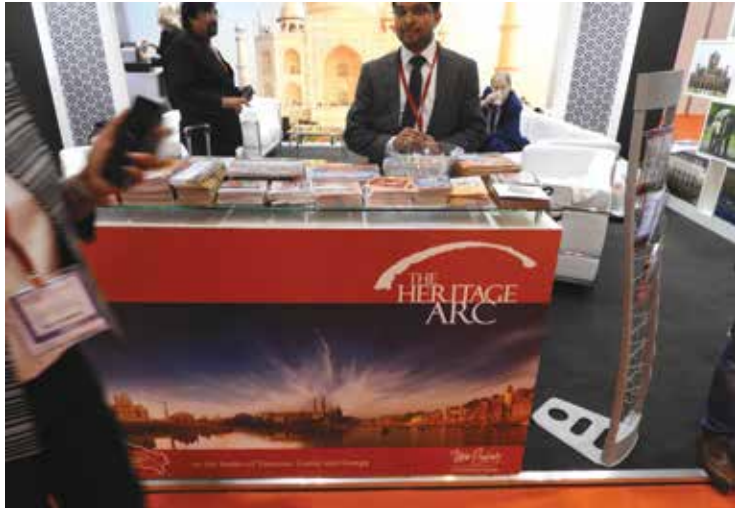
Distribution from UP Tourism Booth