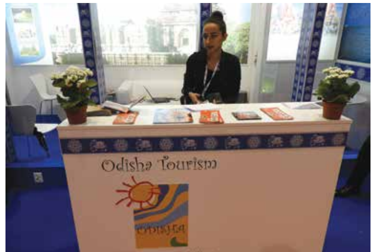
Distribution from Odisha Tourism Booth