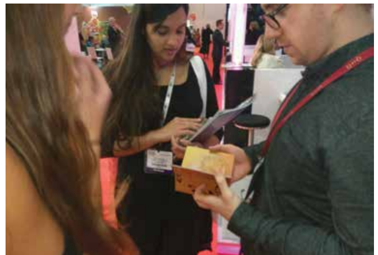
Distribution by hostess