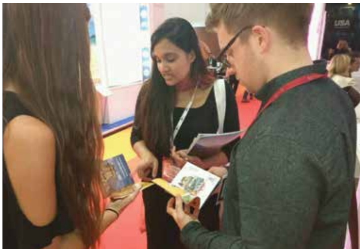
Hostess talking to visitors and distribution