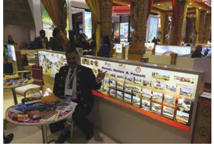
Distribution from Haryana Tourism Booth