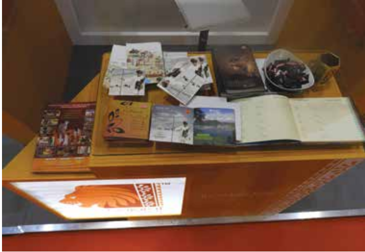
Distribution from Gujarat Tourism Booth