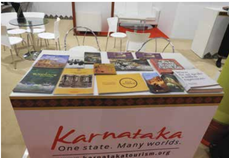
Distribution from Karnataka Tourism Booth