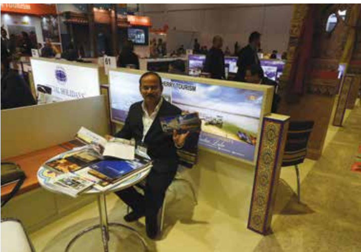
Distribution from Puducherry Tourism Booth