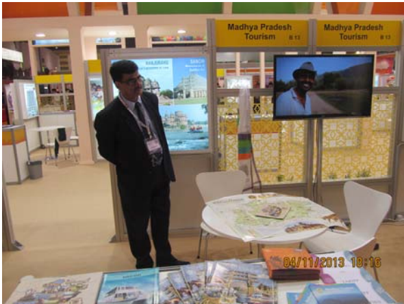
Distribution by MP Tourism