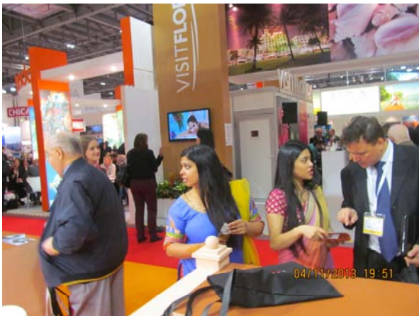
All 3 hostesses distributing eCatalogs