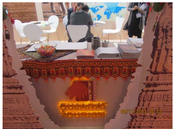
Distribution from Gujarat Tourism