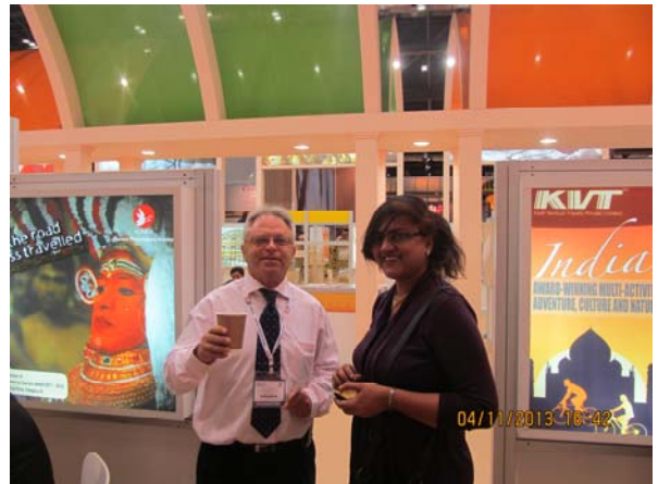
Meeting with Buyer