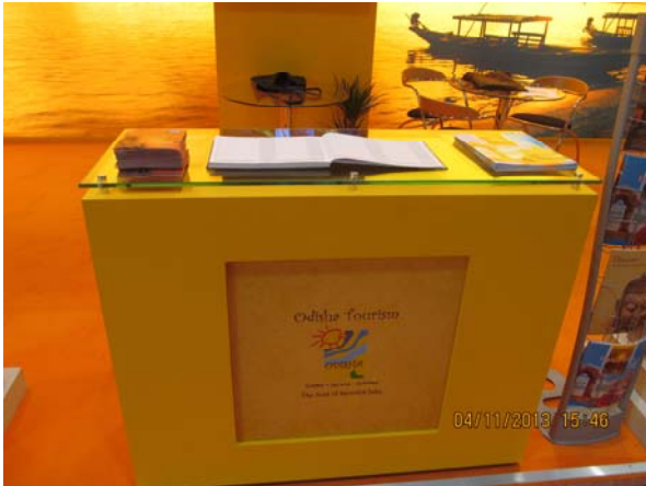
Distribution from Odisha Tourism