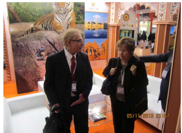
Buyers entering the Rajasthan Pavilion for the networking event