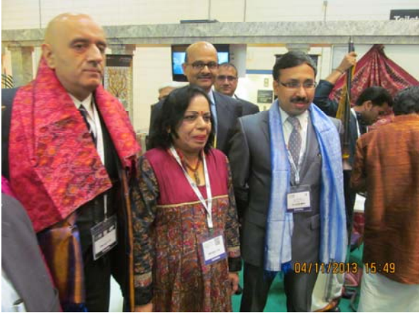
ADG Government of India, Principal Secretary Andhra Tourism, Director Kerala Tourism