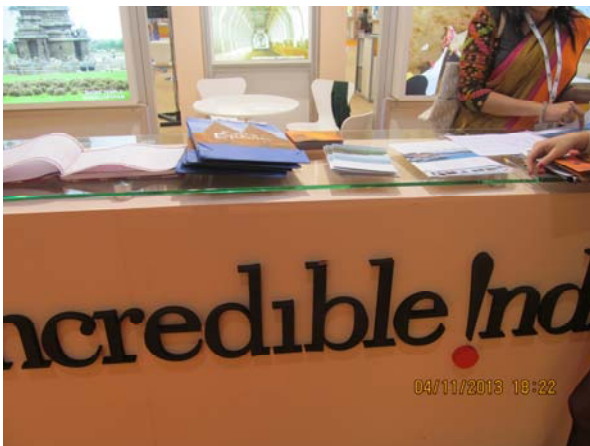
Distribution from India Tourism rear side