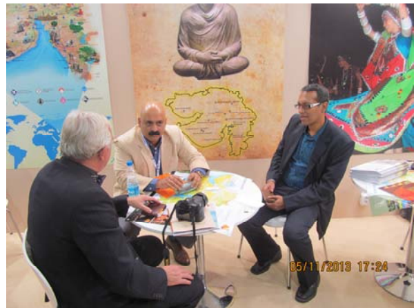
B2B meets for Gujarat Tourism