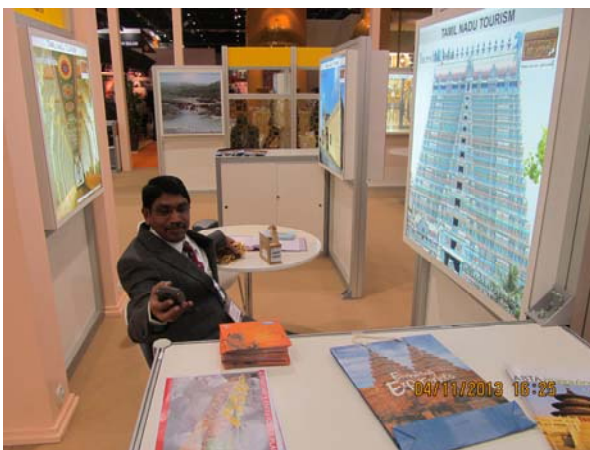
Distribution by Tamil Nadu Tourism