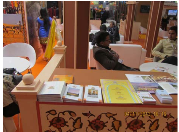
Distribution by Narain Niwas Palace