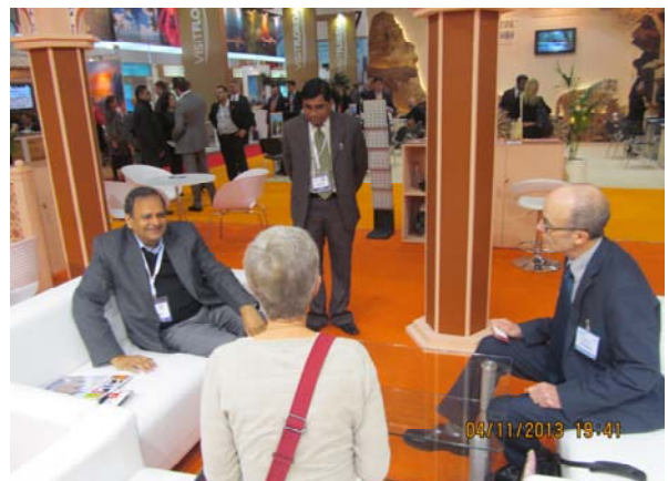
B2B Meets Rajasthan Tourism