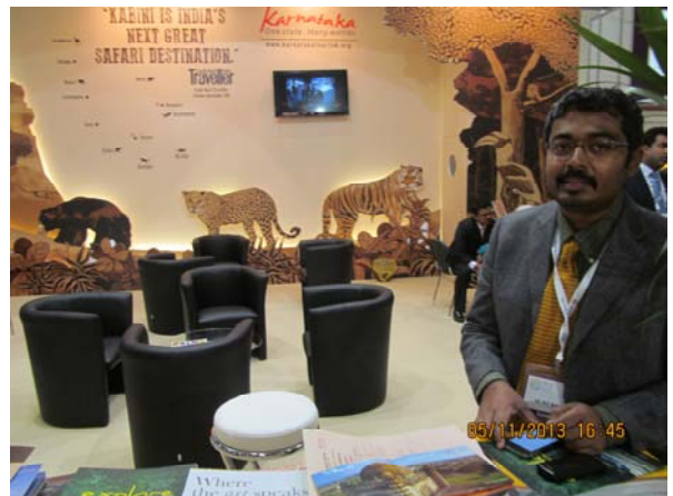
Distribution from Karnataka Tourism