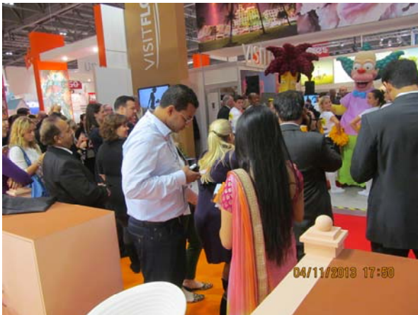
Distribution by hostesses