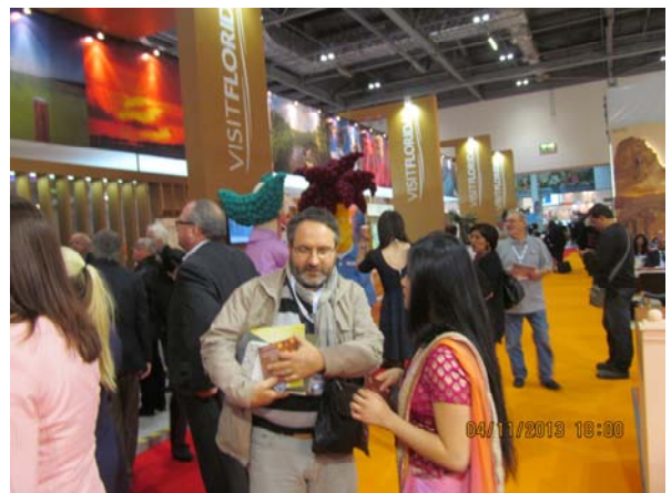
Distribution by hostesses