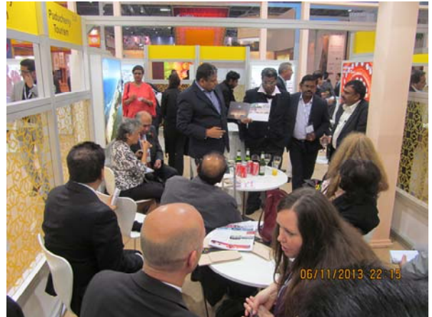
Event for Puducherry Tourism