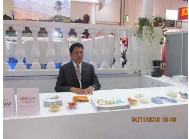
Distribution by Goa Tourism